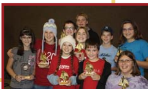
Top 10 Novices

Children's Quizzing got off to a great start on Saturday, November 14. Results in a nutshell: